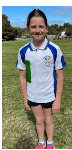
Kartia - 3rd 11 year Old Girls Long Jump