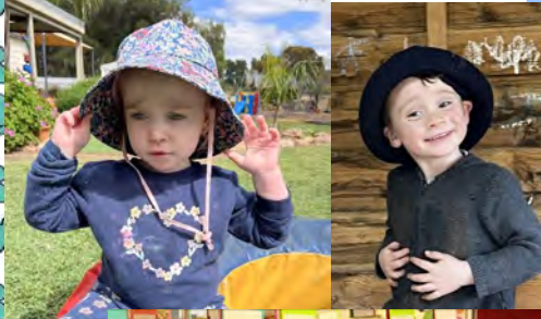
Year 1 students transitioning into the 2/3/4 class

YOU'RE OFF to great to places. Today is your day. YOUR MOUNTAIN IS WAITING. SO GET ON YOUR WAY. -Dr. Seuss WWW.THEMOUNTAINVILLCOTTAGE.NET