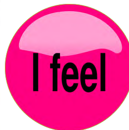
"Sandra taught us to use kind words to make people feel happy."