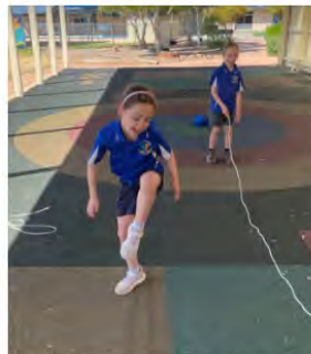
"I love skipping and it is so much fun!" Elsie