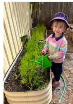
"Laying down with my eye bag on and being in the garden helps me to be calm." Mia