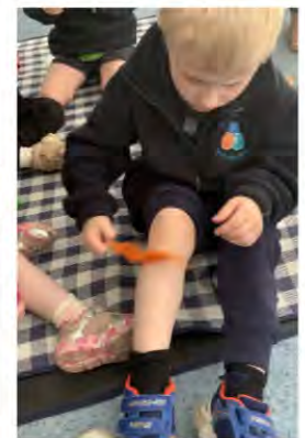
"It tickled my leg." Chris

We have identified, grown and stretched our skills at caring for ourselves in these ways. We can now care for ourselves by: